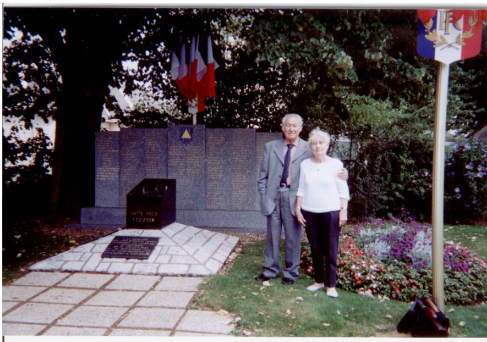
monument at the former entrance of Pithiviers camp