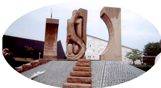
monument at the former entrance of the Drancy camp

Wednesday August 28, 2002 – Drancy – train n° 25