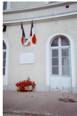
memorial plaque at station