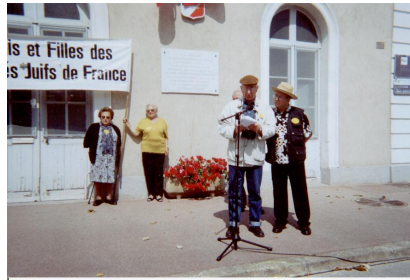
individual call out of the 1069 deportees