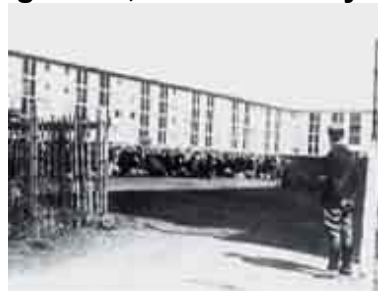
gate of the Drancy camp in 1941

Monday August 19, 2002 – Drancy – train n° 21