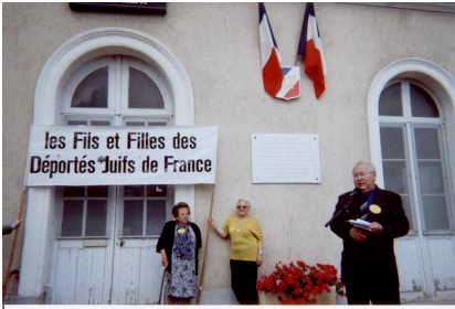
Serge Klarsfeld's speech

Left, photograph taken at Pithiviers on April 17, 1941. Nor did the cinema industry escape censorship on the matter of French collaboration. Alain Resnais's stunning documentary on the Concentration camps, Nuit et Brouillard (1956), was censored to hide the "képi" of a French policeman looking out over the Pithiviers camp. Right, the same photograph, in the doctored version the censors could approve, as it appears in shot n°.39 in Resnais's Nuit et Brouillard .