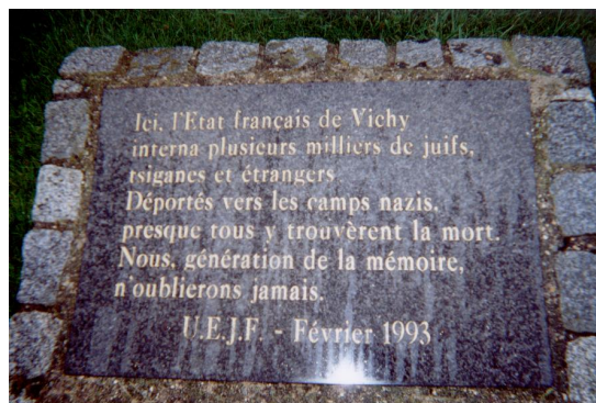
commemorative plaques sealed at the former entrance of the Drancy camp. The French republic will tardily admit (MM Mitterrand, Balladur, then Chirac) the involvement of the parent organization so called « Gouvernement de l'Etat français » in the roundup of July 1942 and the concentration of Jews from France in the camps mentioned in this document.