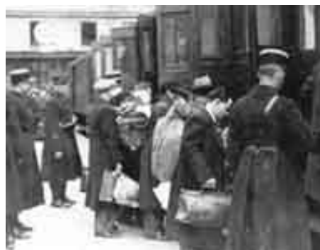
Drancy – departure of the first train to Auschwitz