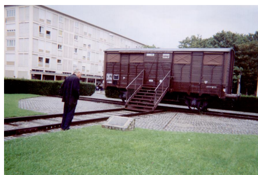
memorial wagon at the former entrance of the Drancy camp ( the buildings which were used for the camp have been refurbished into public housing units )