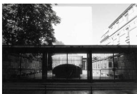
Unknown Martyred Jews Memorial, future location of the Wall of the Names

A monument will be erected at the Centre de Documentation Juive Contemporaine (Unknown Martyred Jews Memorial) located 17 rue Geoffroy l'Asnier (Paris IVè). Named « Wall of the Names », the complete list of deported Jews from France will be engraved. Paperwork has been done to include our family members named in this document. Information given at this occasion has also been transmitted by the CDJC to Yad Vashem (Jerusalem) and to the United States Holocaust Memorial Museum (Washington).