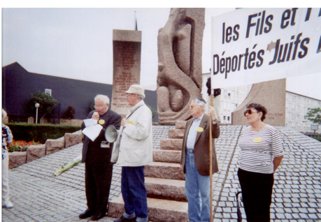
Serge Klarsfeld's speech